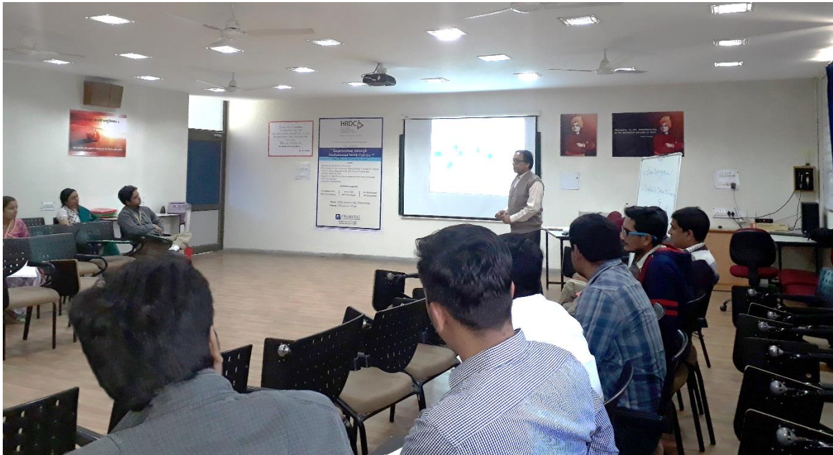
“Empowering through Professional Work Culture” - Faculty Development Programme | 18 Dec. 2017 to 21 Feb. 2018 | Venue: 209, HRDC Seminar Hall, I2IM