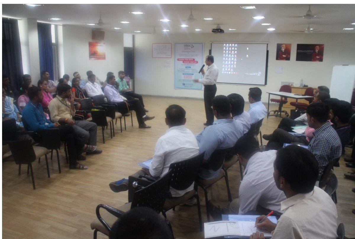
“Change your Image, Change your Life” – ATP for Non-Teaching Staff | 27- 30 June 2018 | Venue: HRDC Seminar Hall, I2IM