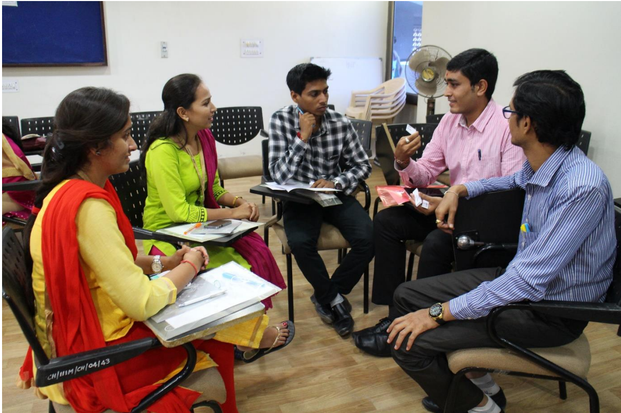
“Learner and the Learning Process” - Faculty Development Programme | 26 Aug to 11 Nov, 2018 | Venue: 209, HRDC Seminar Hall, I2IM