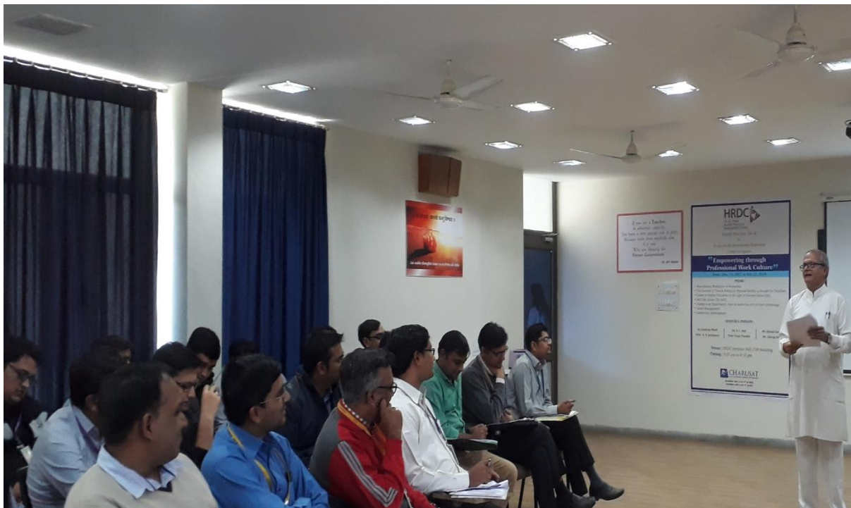
Soft Skill Training Programme for Faculty during Summer Vacation | 21-May-2018 to 26-May-2018 | Venue: 209, HRDC Seminar Hall, I2IM