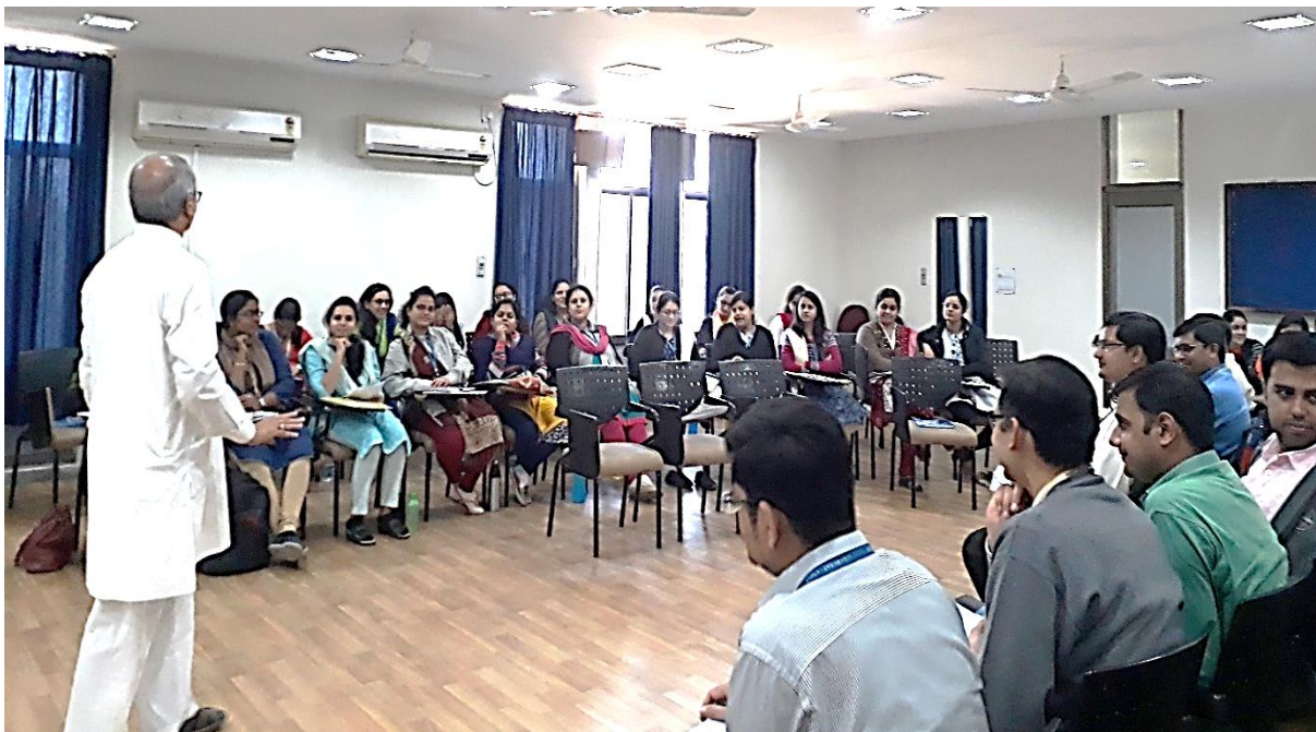
“Empowering through Professional Work Culture” - Faculty Development Programme | 18 Dec. 2017 to 21 Feb. 2018 | Venue: 209, HRDC Seminar Hall, I2IM