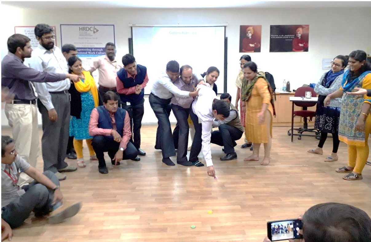
“Empowering through Professional Work Culture” - Faculty Development Programme | 18 Dec. 2017 to 21 Feb. 2018 | Venue: 209, HRDC Seminar Hall, I2IM