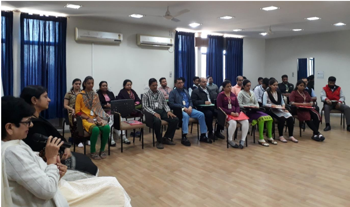
“Empowering through Professional Work Culture” - Faculty Development Programme | 18 Dec. 2017 to 21 Feb. 2018 | Venue: 209, HRDC Seminar Hall, I2IM