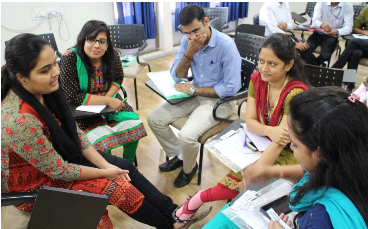
“Learner and the Learning Process” - Faculty Development Programme | 26 Aug to 11 Nov, 2018 | Venue: 209, HRDC Seminar Hall, I2IM