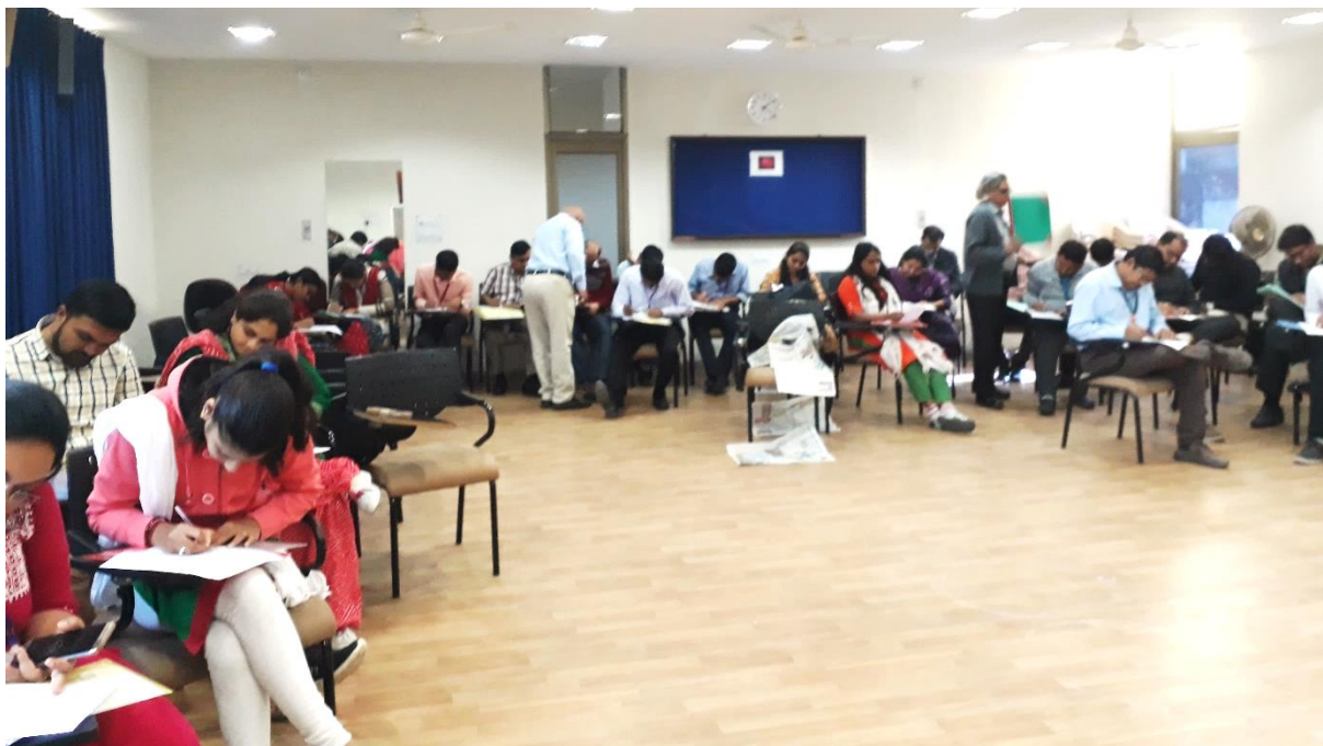
“Empowering through Professional Work Culture” - Faculty Development Programme | 18 Dec. 2017 to 21 Feb. 2018 | Venue: 209, HRDC Seminar Hall, I2IM