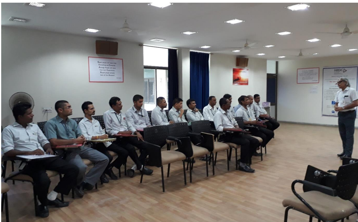
“You are Important – તમે મહત્વપૂર્ણ છો.” Attendant Staff | Tue. 26/06/2018 | Venue: HRDC Seminar Hall I2IM