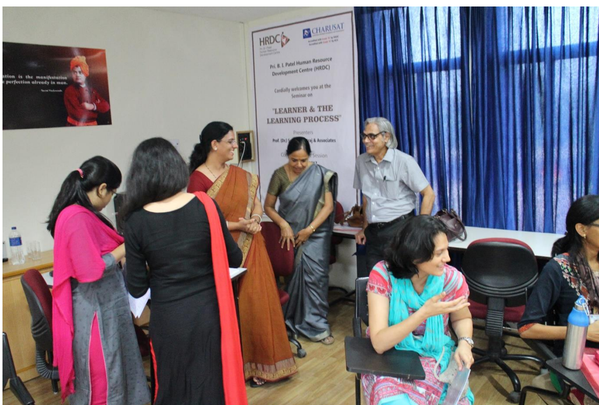
“Learner and the Learning Process” - Faculty Development Programme | 26 Aug to 11 Nov, 2018 | Venue: 209, HRDC Seminar Hall, I2IM