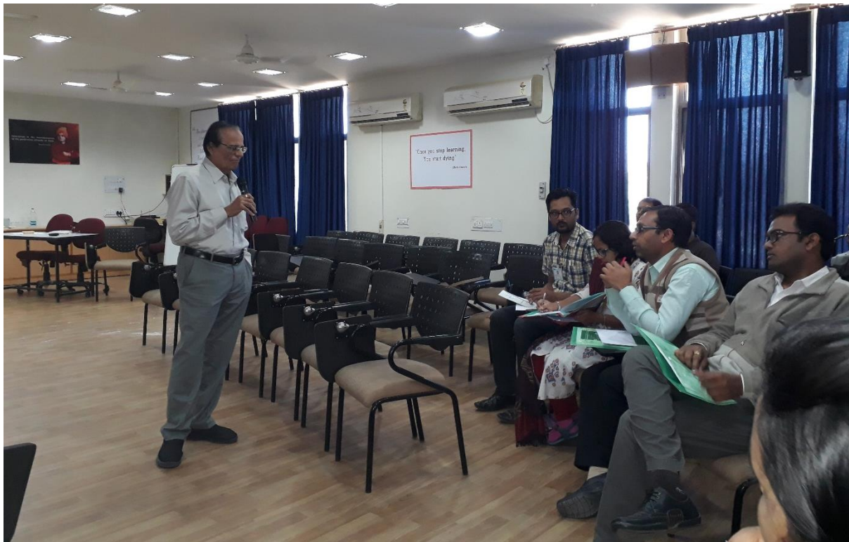
Soft Skill Training Programme for Faculty during Summer Vacation | 21-May-2018 to 26-May-2018 | Venue: 209, HRDC Seminar Hall, I2IM