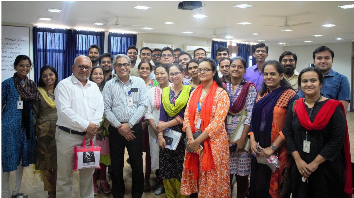
“Empowering through Professional Work Culture” - Faculty Development Programme | 18 Dec. 2017 to 21 Feb. 2018 | Venue: 209, HRDC Seminar Hall, I2IM