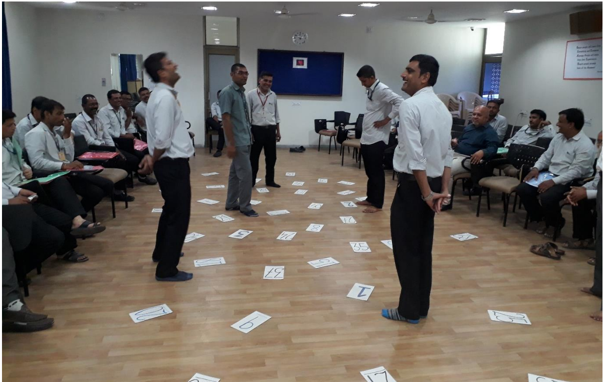
“You are Important – તમે મહત્વપૂર્ણ છો.” Attendant Staff | Tue. 26/06/2018 | Venue: HRDC Seminar Hall I2IM