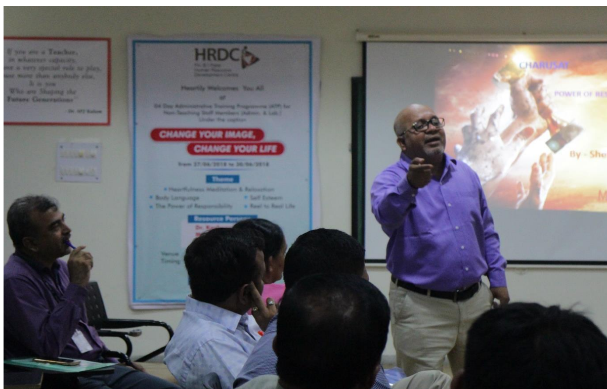
“Change your Image, Change your Life” – ATP for Non-Teaching Staff | 27- 30 June 2018 | Venue: HRDC Seminar Hall, I2IM