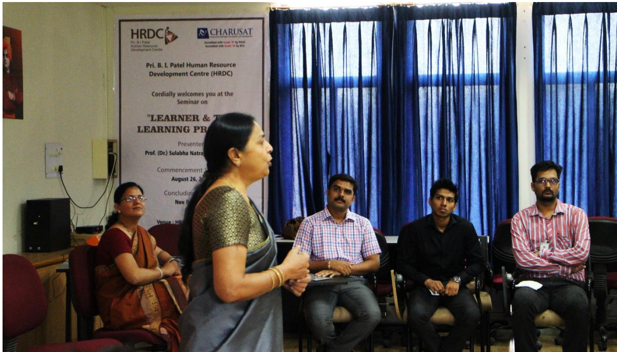
“Learner and the Learning Process” - Faculty Development Programme | 26 Aug to 11 Nov, 2018 | Venue: 209, HRDC Seminar Hall, I2IM