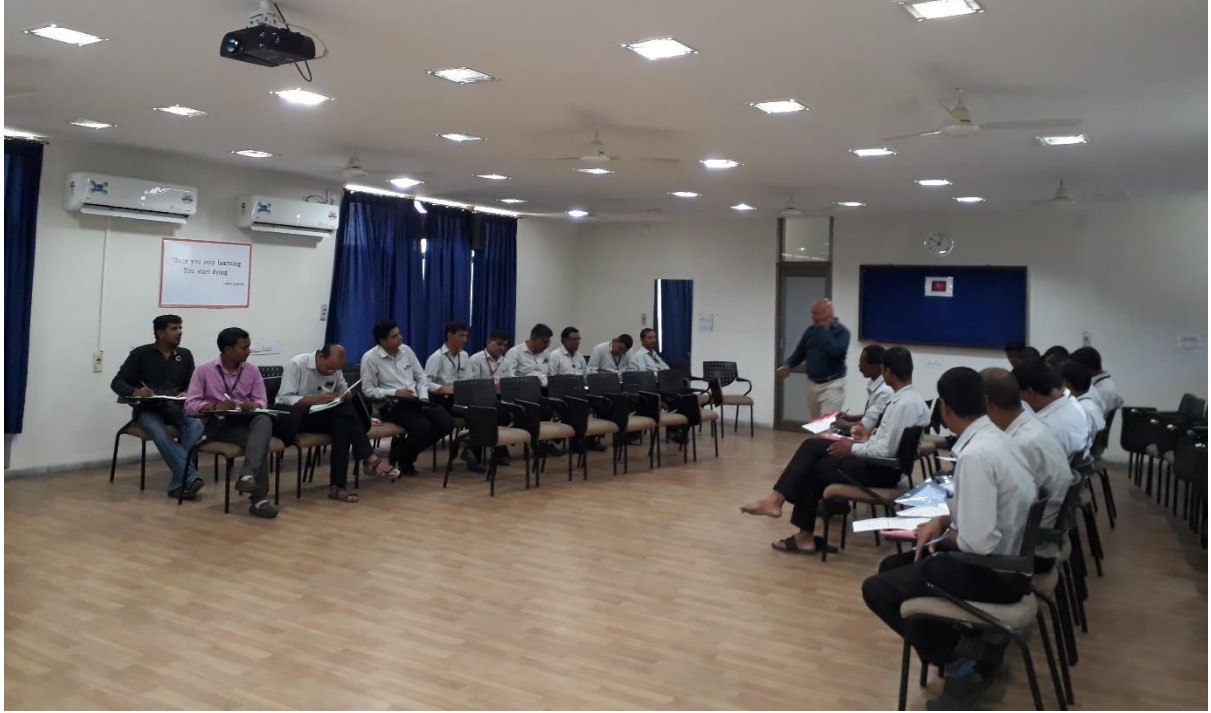
“You are Important – તમે મહત્વપૂર્ણ છો.” Attendant Staff | Tue. 26/06/2018 | Venue: HRDC Seminar Hall I2IM