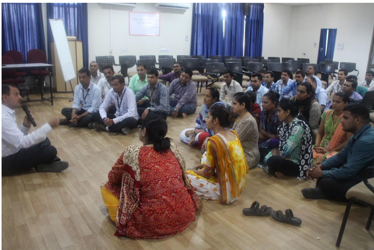
“Change your Image, Change your Life” – ATP for Non-Teaching Staff | 27- 30 June 2018 | Venue: HRDC Seminar Hall, I2IM