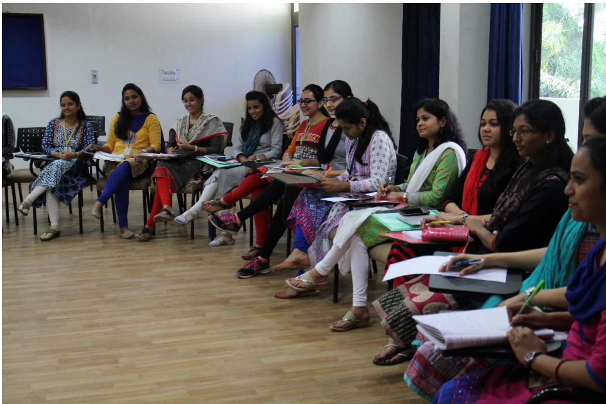
“Learner and the Learning Process” - Faculty Development Programme | 26 Aug to 11 Nov, 2018 | Venue: 209, HRDC Seminar Hall, I2IM