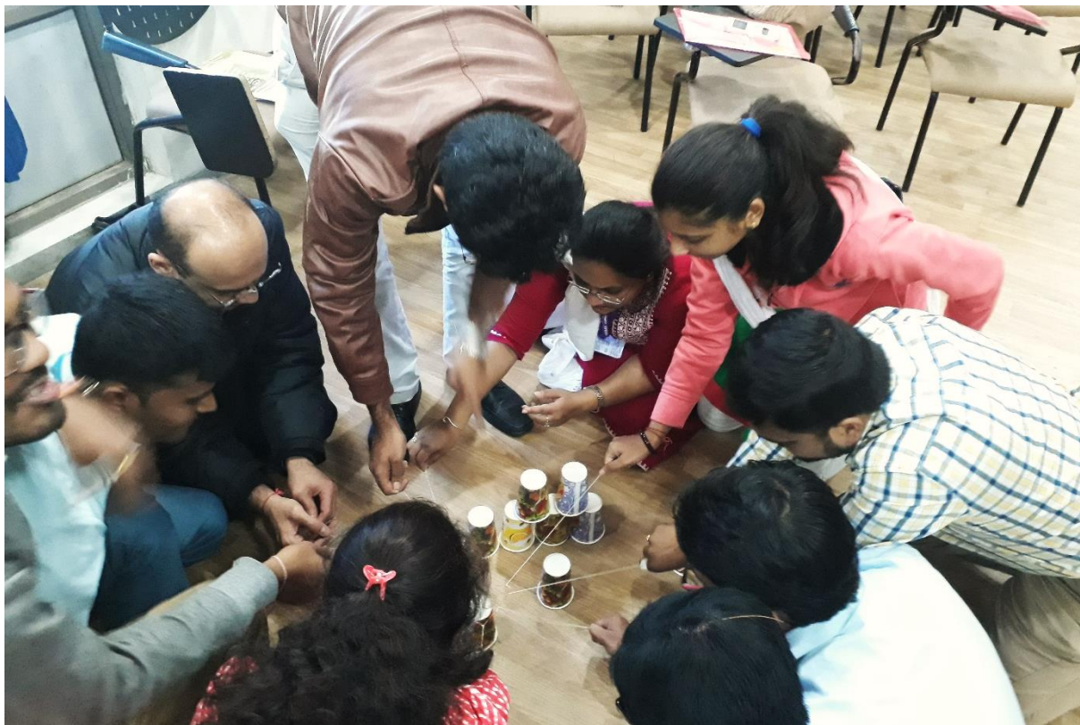
“Empowering through Professional Work Culture” - Faculty Development Programme | 18 Dec. 2017 to 21 Feb. 2018 | Venue: 209, HRDC Seminar Hall, I2IM