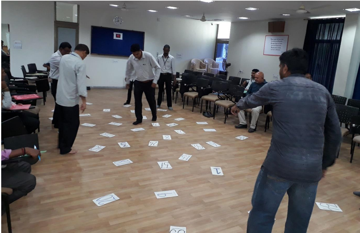
“You are Important – તમે મહત્વપૂર્ણ છો.” Attendant Staff | Tue. 26/06/2018 | Venue: HRDC Seminar Hall I2IM