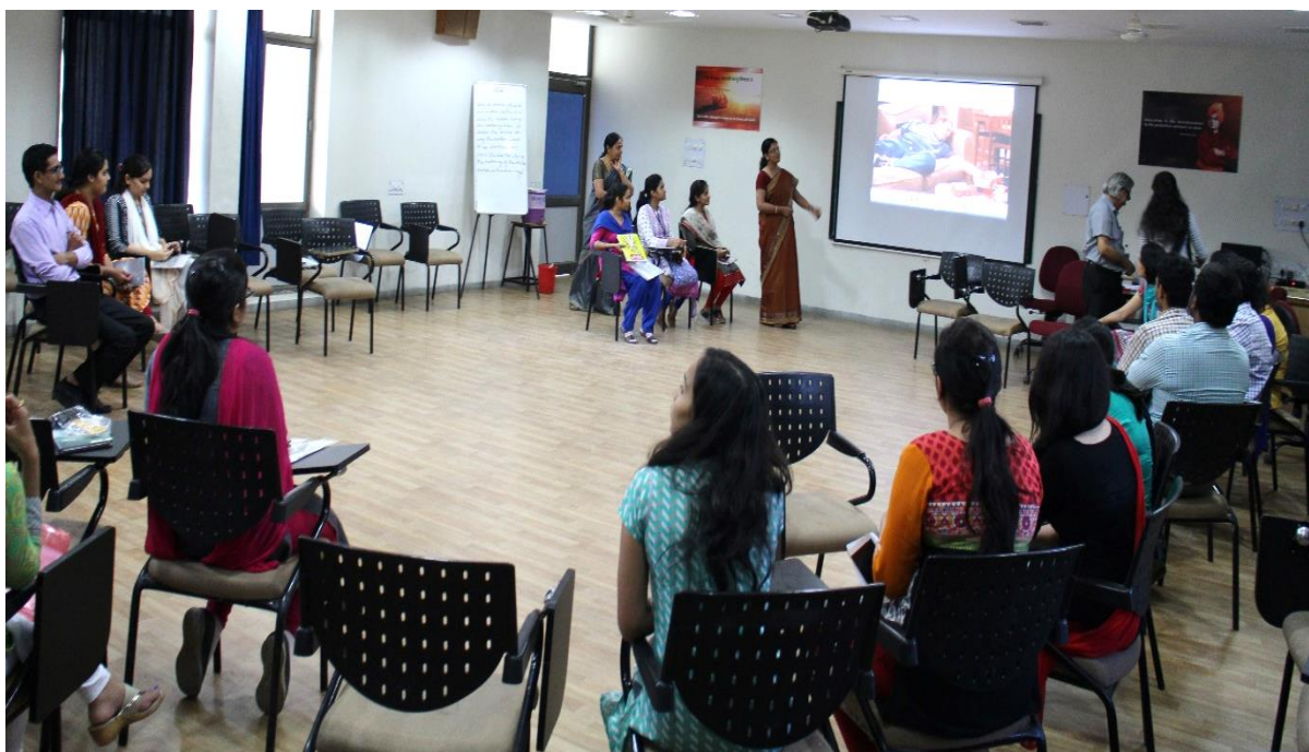
“Learner and the Learning Process” - Faculty Development Programme | 26 Aug to 11 Nov, 2018 | Venue: 209, HRDC Seminar Hall, I2IM