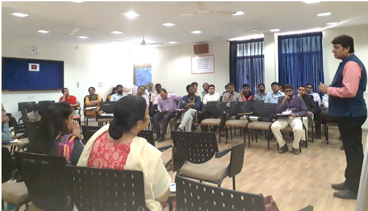
“Empowering through Professional Work Culture” - Faculty Development Programme | 18 Dec. 2017 to 21 Feb. 2018 | Venue: 209, HRDC Seminar Hall, I2IM