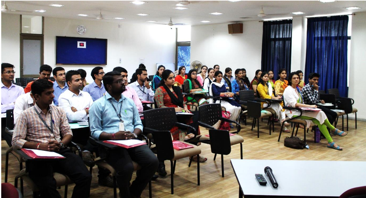
“Learner and the Learning Process” - Faculty Development Programme | 26 Aug to 11 Nov, 2018 | Venue: 209, HRDC Seminar Hall, I2IM