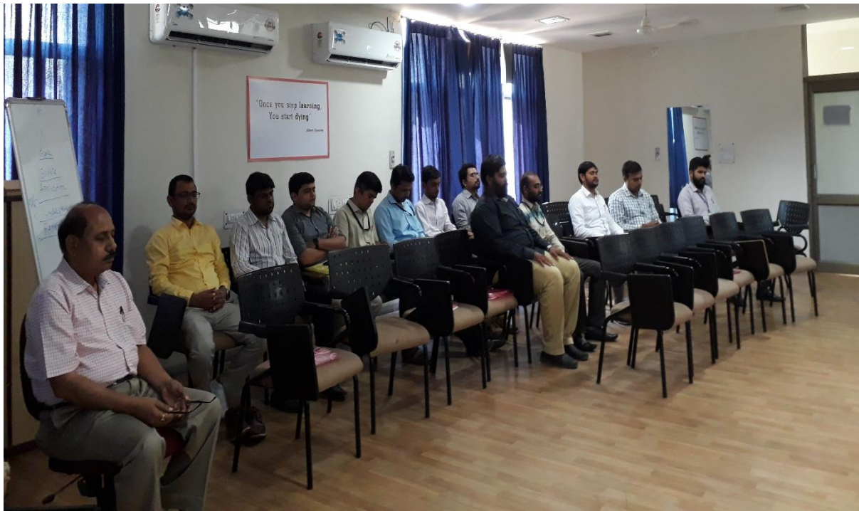
Soft Skill Training Programme for Faculty during Summer Vacation | 21-May-2018 to 26-May-2018 | Venue: 209, HRDC Seminar Hall, I2IM