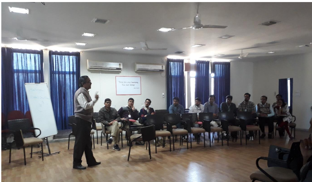
Soft Skill Training Programme for Faculty during Summer Vacation | 21-May-2018 to 26-May-2018 | Venue: 209, HRDC Seminar Hall, I2IM