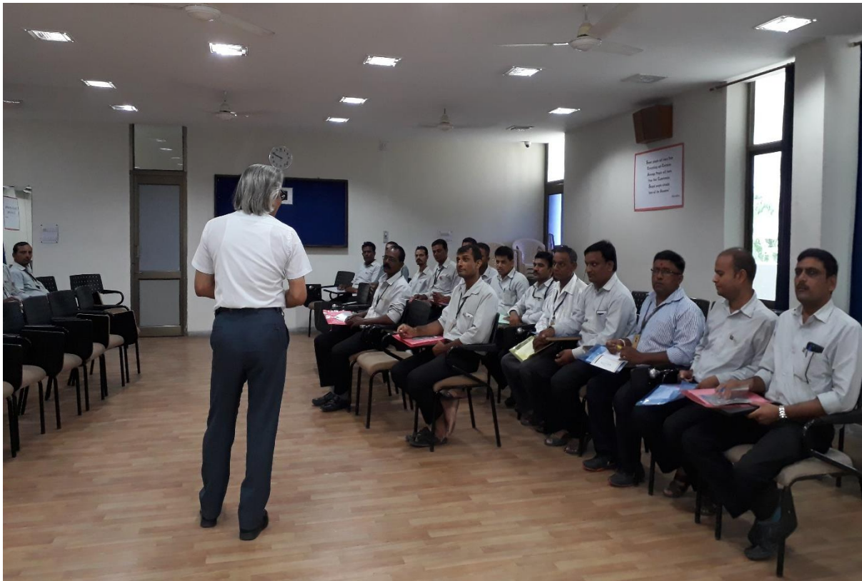
“You are Important – તમે મહત્વપૂર્ણ છો.” Attendant Staff | Tue. 26/06/2018 | Venue: HRDC Seminar Hall I2IM