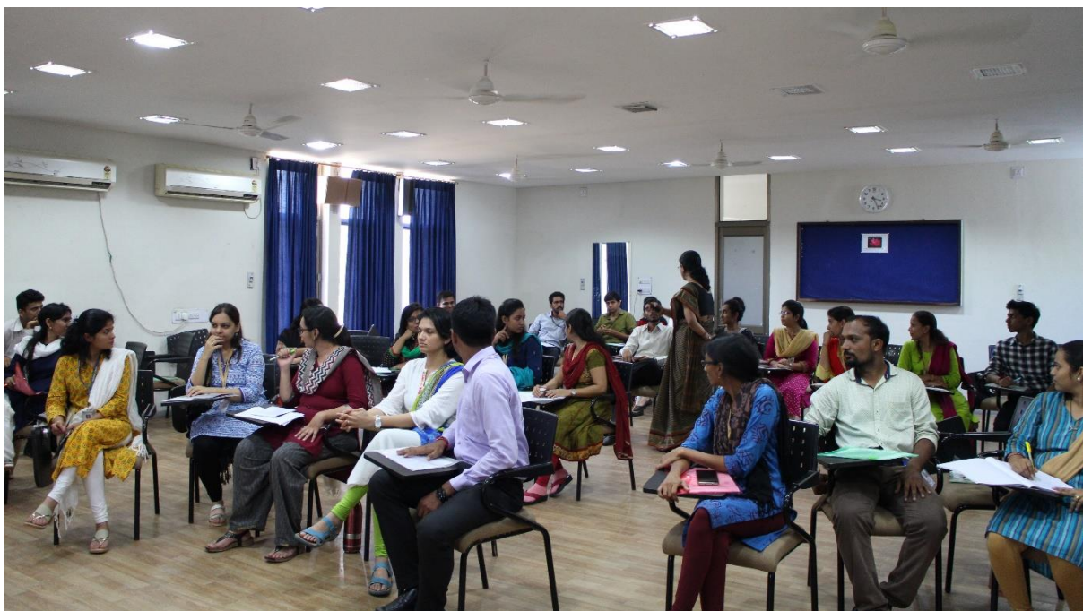
“Learner and the Learning Process” - Faculty Development Programme | 26 Aug to 11 Nov, 2018 | Venue: 209, HRDC Seminar Hall, I2IM