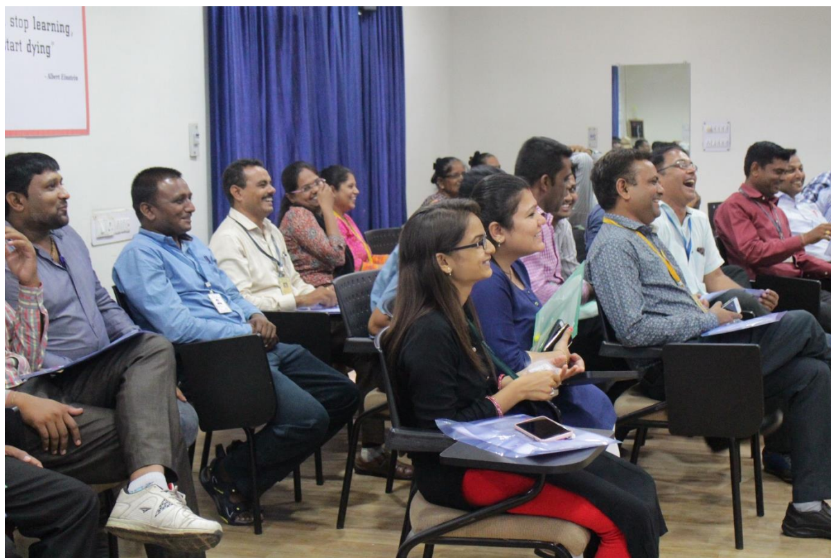
“Change your Image, Change your Life” – ATP for Non-Teaching Staff | 27- 30 June 2018 | Venue: HRDC Seminar Hall, I2IM