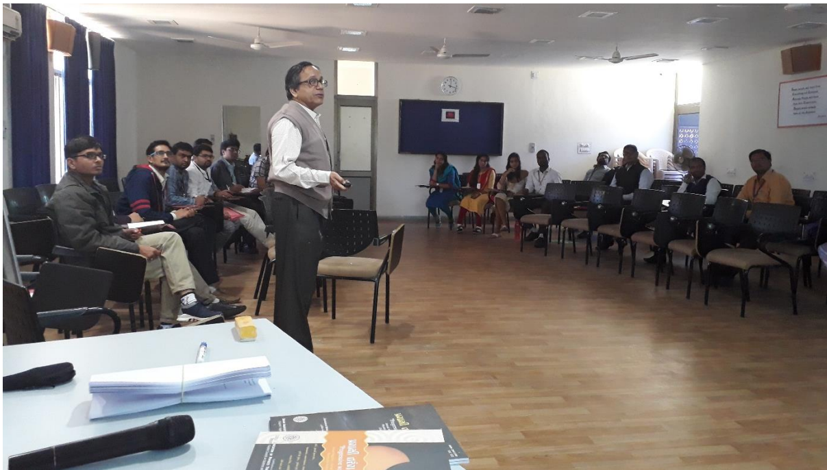
Soft Skill Training Programme for Faculty during Summer Vacation | 21-May-2018 to 26-May-2018 | Venue: 209, HRDC Seminar Hall, I2IM