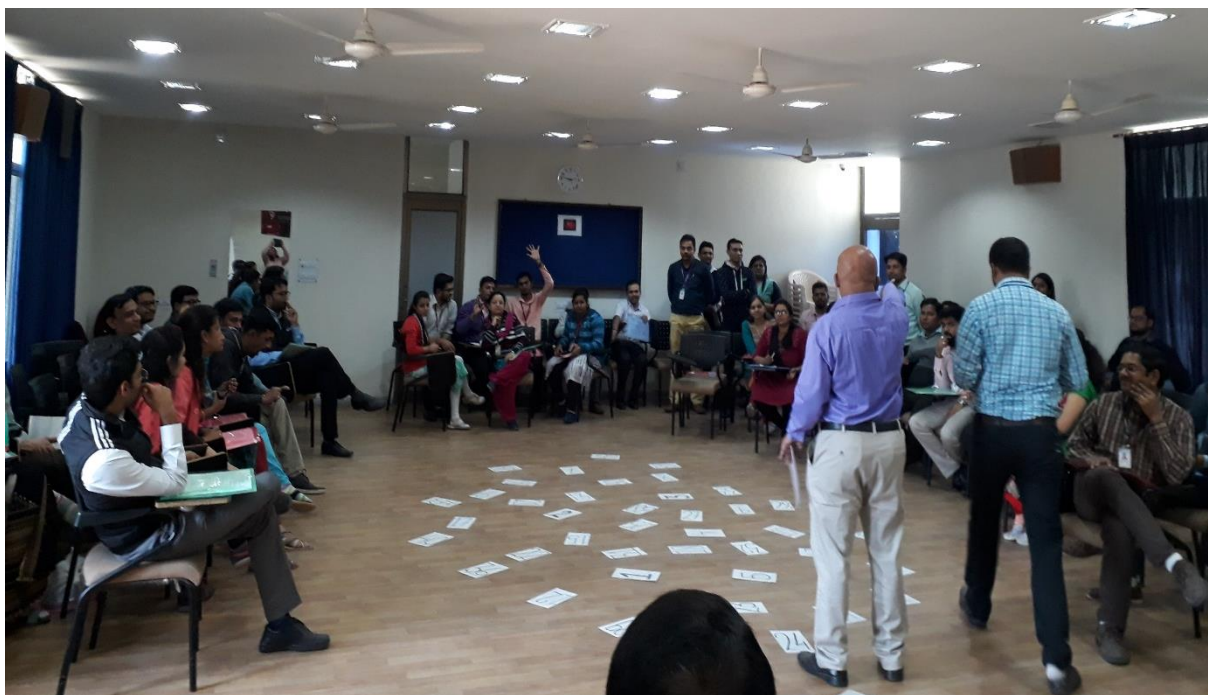
“Empowering through Professional Work Culture” - Faculty Development Programme | 18 Dec. 2017 to 21 Feb. 2018 | Venue: 209, HRDC Seminar Hall, I2IM