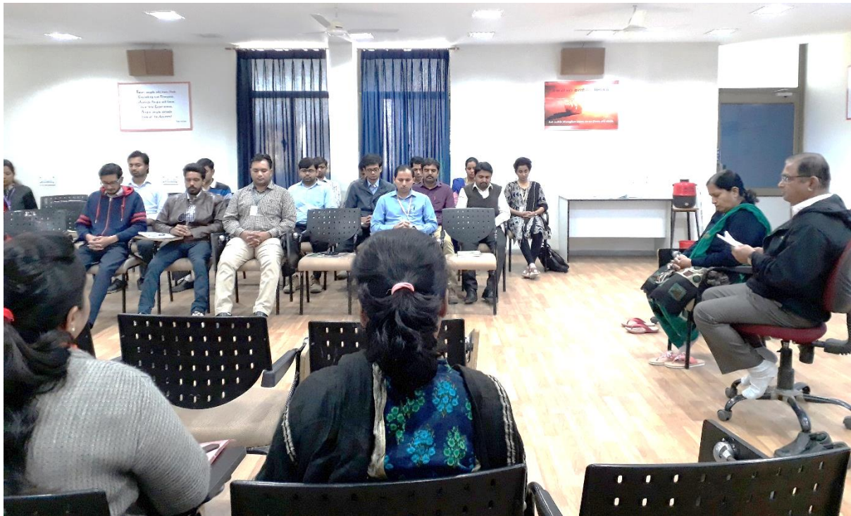
“Empowering through Professional Work Culture” - Faculty Development Programme | 18 Dec. 2017 to 21 Feb. 2018 | Venue: 209, HRDC Seminar Hall, I2IM