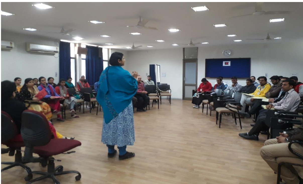
Soft Skill Training Programme for Faculty during Summer Vacation | 21-May-2018 to 26-May-2018 | Venue: 209, HRDC Seminar Hall, I2IM