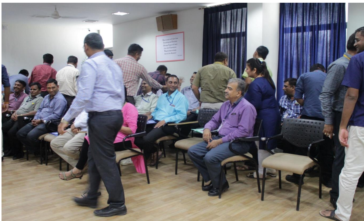
“Change your Image, Change your Life” – ATP for Non-Teaching Staff | 27- 30 June 2018 | Venue: HRDC Seminar Hall, I2IM