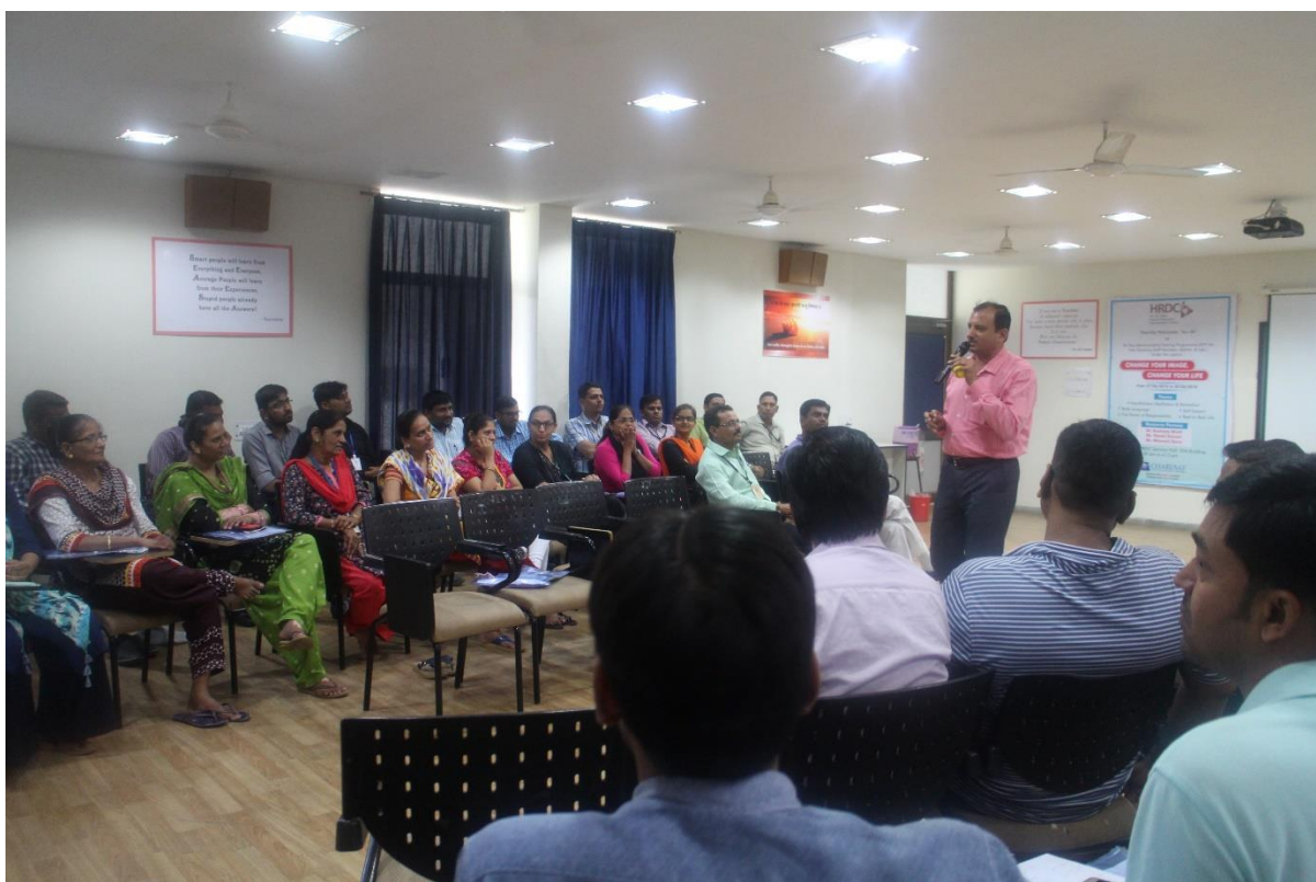
“Change your Image, Change your Life” – ATP for Non-Teaching Staff | 27- 30 June 2018 | Venue: HRDC Seminar Hall, I2IM