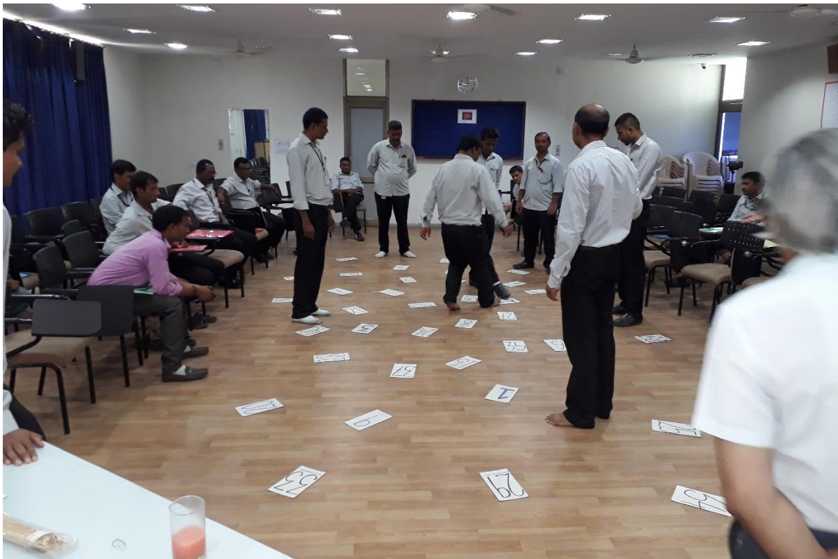
“You are Important – તમે મહત્વપૂર્ણ છો.” Attendant Staff | Tue. 26/06/2018 | Venue: HRDC Seminar Hall I2IM